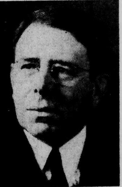
KIWANIS SPEAKER — Former Governor J. Melville Broughton, above, will be guest speaker at tonight's meeting of the Elkin Kiwanis Club, which is sponsoring the sixth annual Farmers' Day Program here today. Mr. Broughton has attended every Farmers' Day Program since the event was launched as an annual affair in 1943.