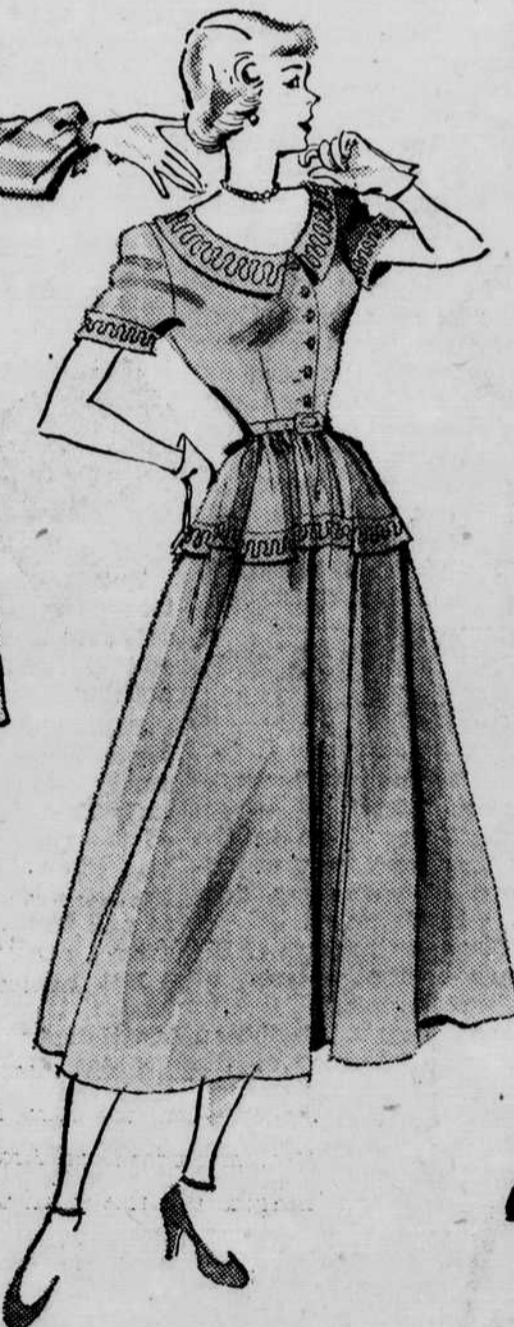
"Stitch in Time". For a pretty afternoon, Sanforized* end-to-end chambray in pink, blue, gold. $8.95