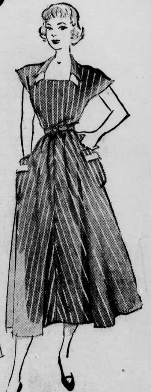
"Day-Farer". For any day, any time, Sanforized* cordspun in green, brown, navy or black with white stripe. $8.95