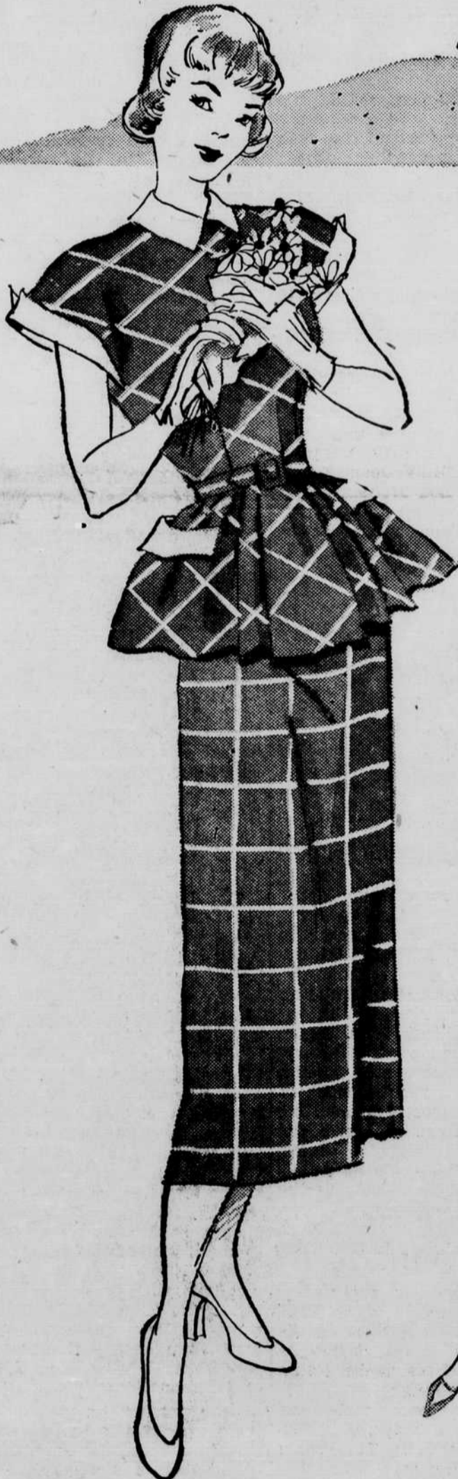
"On the Square". For a day in town, pre-shrunk plaid gingham in royal, brown, green, black. Sizes 9 to 15. $10.95