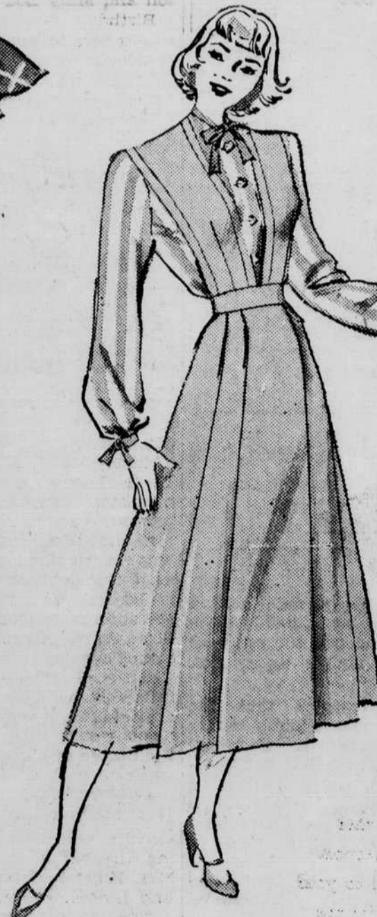
"Cotton Blossom". Happy combination, solid jumper and striped blouse in dark blue, dark green, brown chambray; Sanforized! $10.95