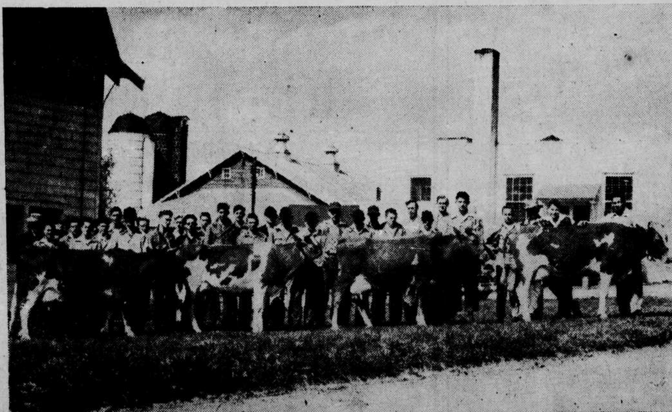
SURRY-YADKIN FFA JUDGING TEAMS — Future Farmers of America stand by dairy cattle at Klondike Farm where they last week participated in the annual cattle judging contest. Boonville's club was overall winner. Beulah won first in dairy cattle judging and East Bend won the beef judging honors.

Prizes will be given 4-H members who sell the most tickets. Projects and scrapbooks of counsellors of the Reeves Theatre.