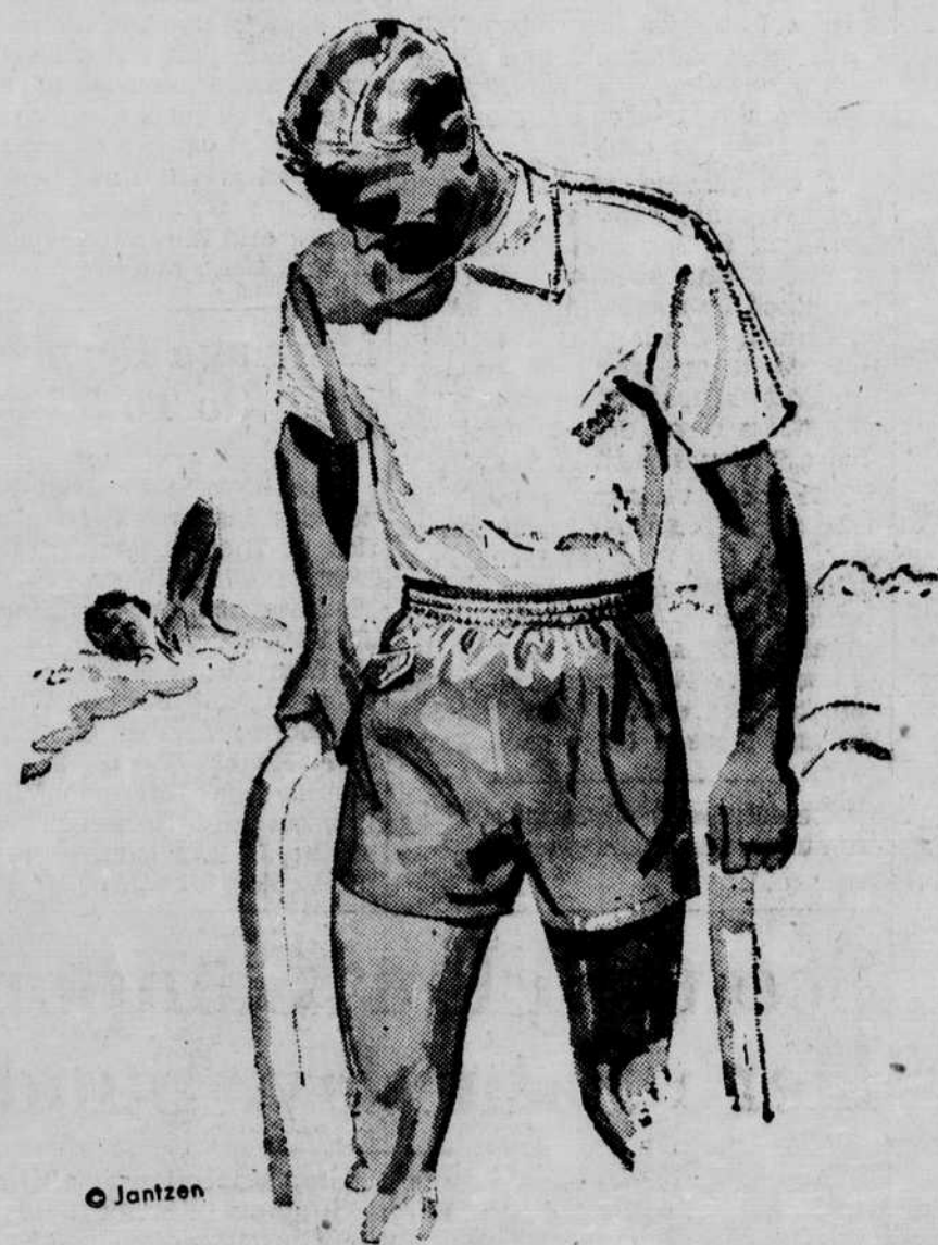
"TEE SHIRT" (Left)

For swim or play the Jantzen "INCA" is sure to be popular with men. Snug fitting, four-needle fighter waist with built-in drawcord for trim fit. Tailored-in key pocket that stays closed even in the most active wear. Built-in supporter. Oxford cloth. Sizes 28-40, three good colors ..... 4.95