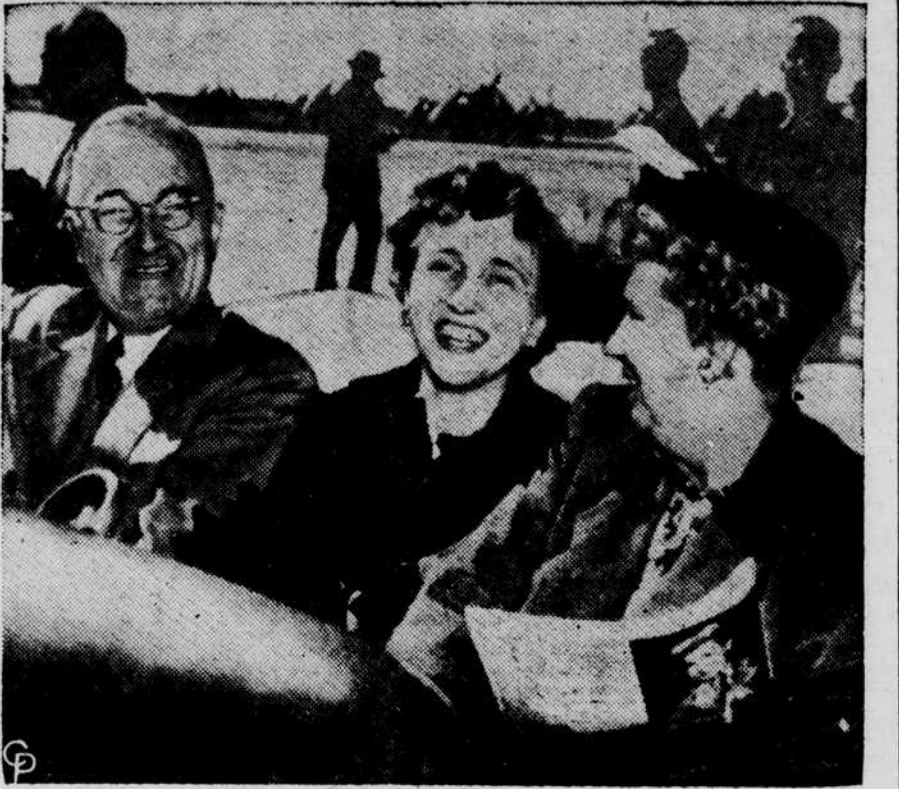
TRUMANS REACH VACATIONLAND — A happy threesome are President Truman, his wife and daughter, Margaret, as they drive toward the "little White House" at the Naval Air Station in Key West, Fla., for a three-week holiday.