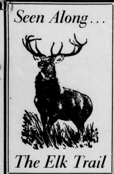
The Elk Trail

Seen Along... Numerous sleds of all sizes in numerous Elkin stores, leading to the belief that local merchants expect lots of snow this winter.