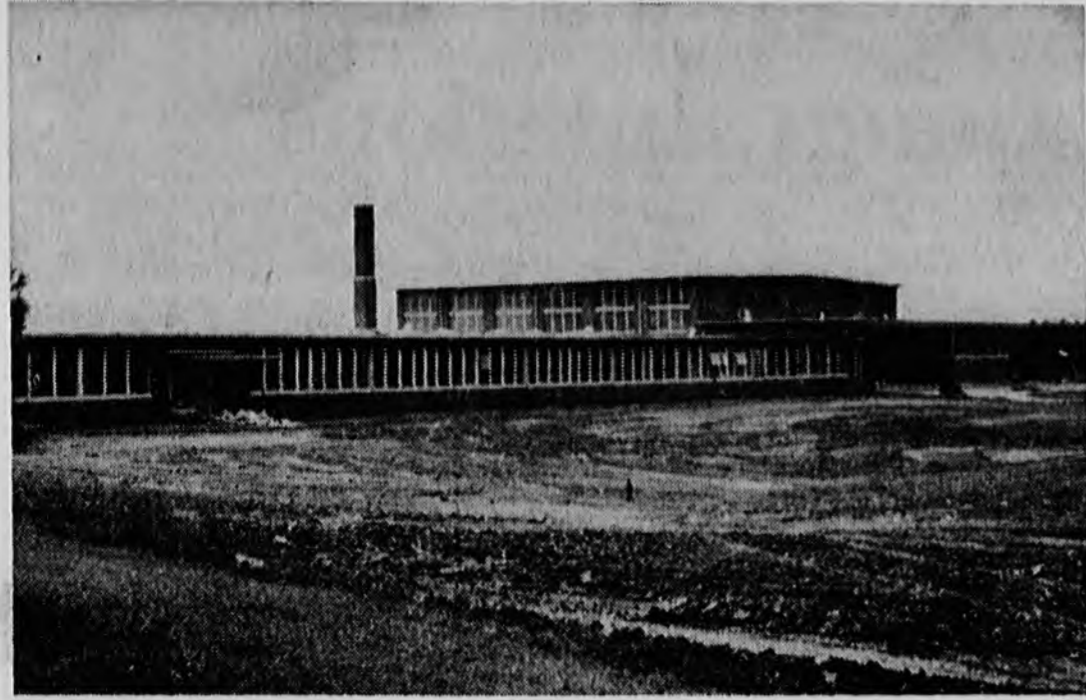
FOR DOBSON AREA—This is Surry Central located at Dobson, one of the two newest school plants in the county's consolidation program. Expected enrollment here will be 650.