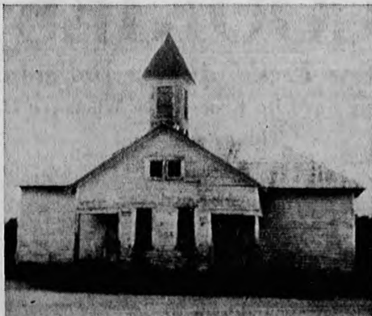
DISAPPEARING—Few schools like this remain in Wilkes County. This is Pleasant Ridge school, made in the 1930s, when there were 89 elementary schools and nine union schools in the county. In the program of consolidation, begun about 25 years ago, most buildings like this one have been eliminated. There are now 21 elementary and four high schools in the Wilkes County system.