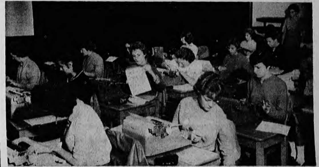
EDUCATIONAL ACTIVITIES IN JONESVILLE—Top, Library of the Jonesville High School. Bottom, Typing class, part of the course in preparation for business.