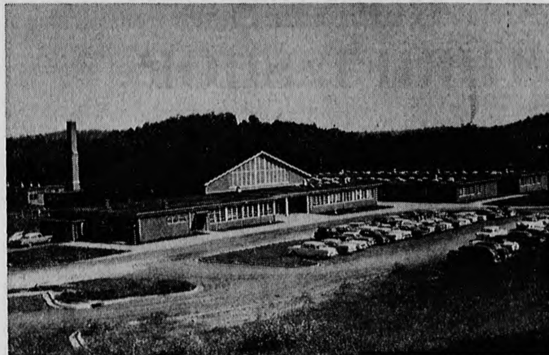
NORTH SURRY HIGH—The first of the three high schools completed for Surry's County school system. Location—three miles west of Mt. Airy.