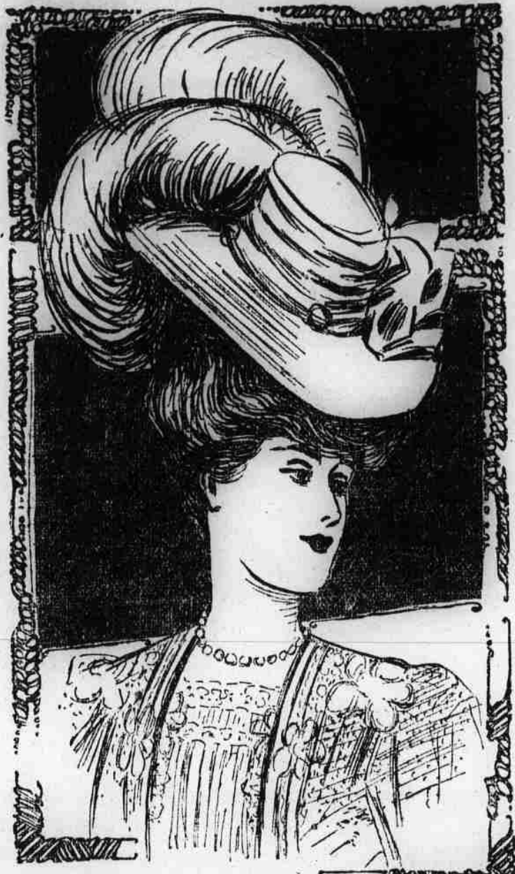
FINE CHIP STRAW WITH PLUMES.

Large shepherdess hats of fine chip straw are most suitable trimmed with graceful plumes. This one is of white and the feathers shade into a delicate tint of apricot pink, which promises to be the favorite color of the season. The rosette is of soft white silk.