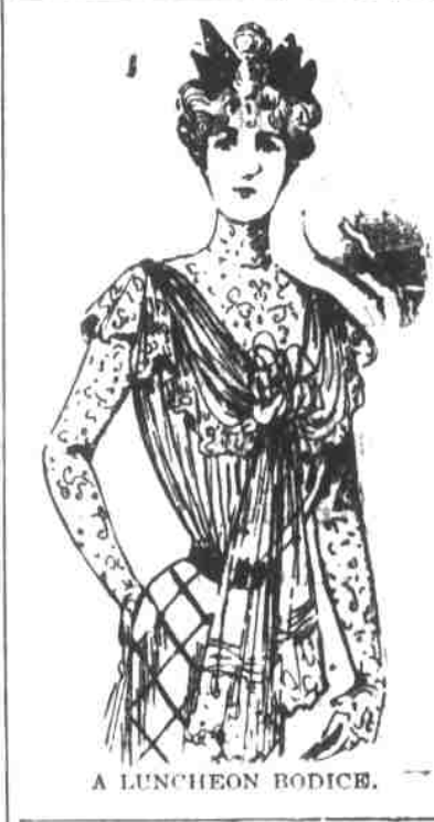
A LUNCHEON RODICE.

The plain black kind will always hold position in the shoe fashions, and the medium length toe, not the extreme bulldog, or point, is always pretty.