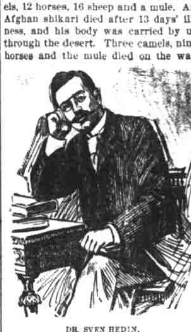
DR. SVEN HEDIN.

Dr. Sven Hedin in a letter to the king of Sweden describes his journey last summer as the most successful part of the expedition, says the London Standard. He says: "We left Tumen on July 20 to explore the unknown regions to the north of Tibet, covering the distance there and back to headquarters, 1,550 kilometers both ways, within 63 days through quite unknown regions. The route was mapped on 173 sheets. The caravan on leaving consisted of 6 followers, 7 camels, 12 horses, 16 sheep and a mule. An Afghan shikari died after 13 days' illness, and his body was carried by us through the desert. Three camels, nine horses and the mule died on the way