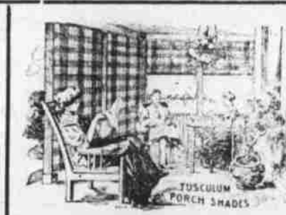
TUSCULUM PORCH SHADES

Buy at once if you want to save money. Such opportunities are seldom presented.