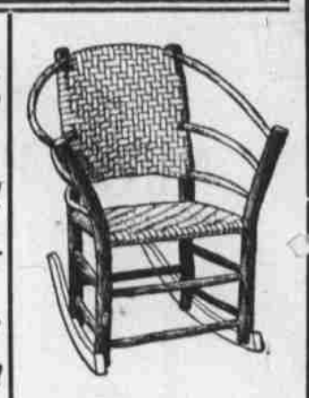
BEST IN THE WORLD.

if the lack of money prevents you from buying necessities for your home. Will furnish a single piece, a single room, or the entire house, and you can pay us a tittle each week or month HICKORY PORCH AND LAWN just as it suits you best.