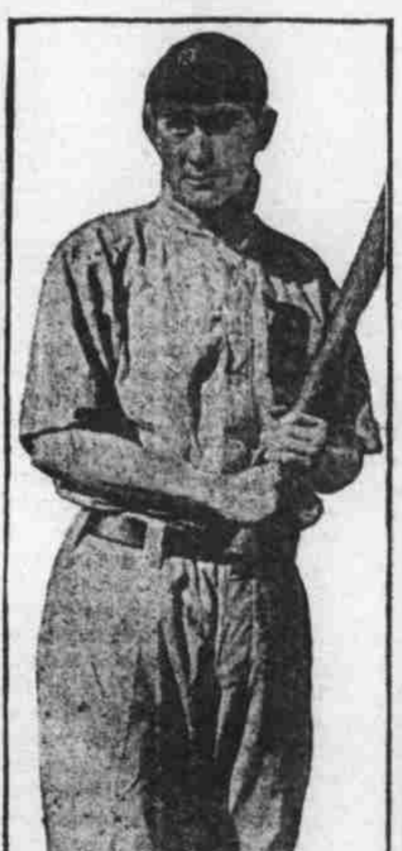
TY COBB, DETROIT'S GREAT OUTFIELDER.