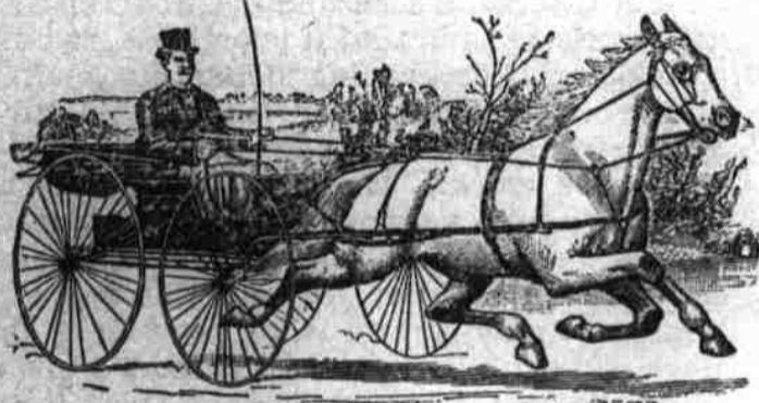
Has always on hand the Largest and Most Complete Stock of