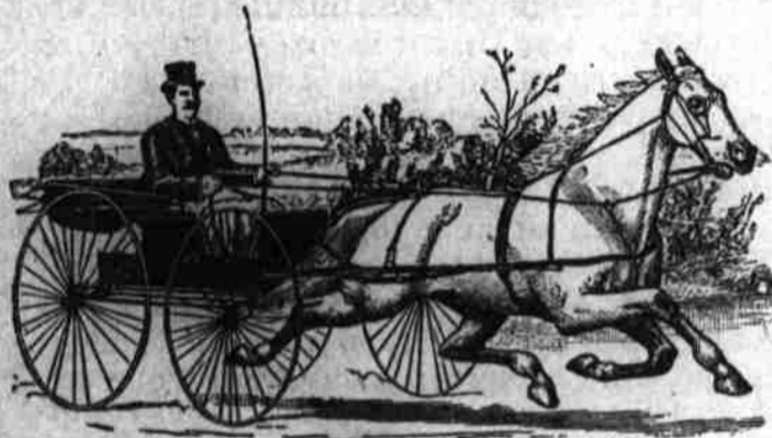
Has always on hand the Largest and Most Complete Stock of