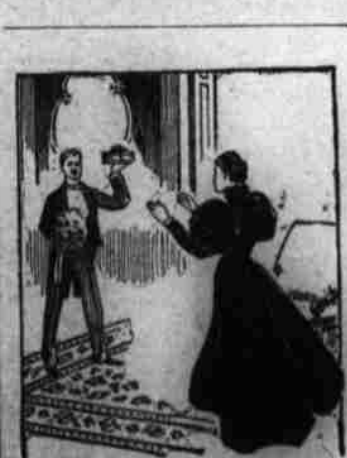
elt is Better to Have