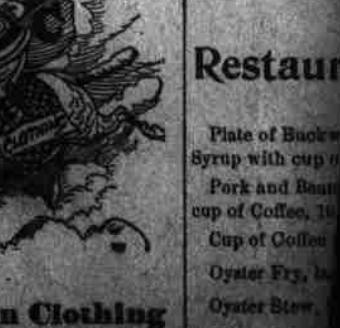
Plate of B