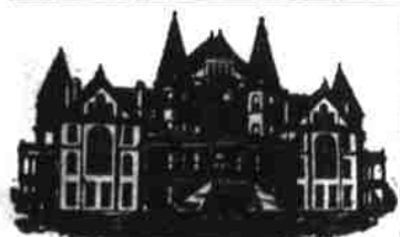
Baptist Female University RALEIGH, N. C.

"In the heart of the city, one block from Capitol and Governor's Mansion and two from State Library. Second session. Enrollment, 224. Faculty of five men and fifteen women. 13 District Schools, viz: English, Latin, Greek, Modern Languages, Mathematics, Natural Science, Moral Philosophy, History and Political Science, Art, Music, Expression, and Business. Expenses per school year, including Board, Room, Heat, Light, Baths, Literary Tuition, Incidental Fees and Laundry, $175. Spring term opens January 16. We have room for thirty other students."