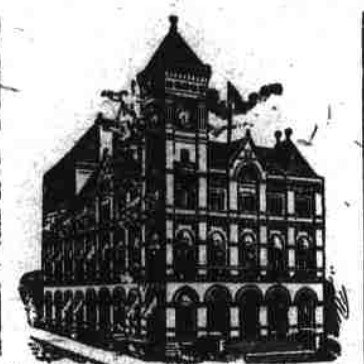
Postoffice Building, Montgomery, Ala.

Use Peruna For Colds, Coughs and Catarrh.