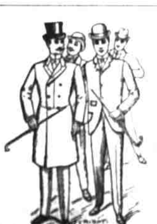
A DRESS PARADE

is Fashion's review. Weavers of our is Fashion's review. Weavers of our made to order suits form a striking pro-cession. Our stock of woolens presents the first choices in the fabrics for this sances. Light as a nephyr, cool as a hillion, and artistic as a picture, these patterns hold admiration prisoner and make up in the natical suits in town. We fit all perfectly.