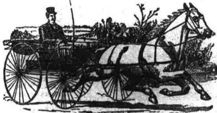
Largest and Finest Stock of