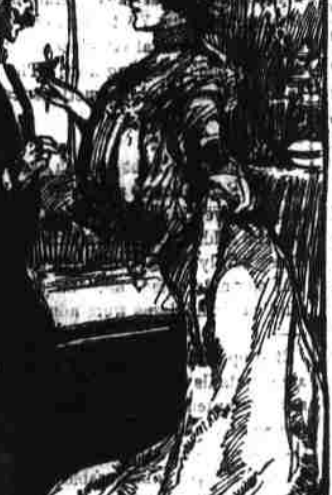
"IT IS A STRANGE FLOWER." "I agree with you," he whispered back. "That was smart, but unkind. When I said, 'Cherish it,' he gasped. When I ended up with my last, 'Keep it, he nearly threw a fit. It did not help me out at all. But I got even with him."

Jewels, candy, flowers, man—that is the order of a woman's preferences. Jewels form a magnet of mighty power to the average woman.