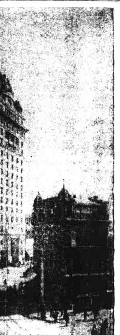
THE CALL BUILDING, ALSO DESTROYED.

The Call and Examiner buildings were almost totally destroyed in the earthquake and many other skyscrapers were severely shaken, cracked and damaged. One of the chief buildings which collapsed was the new postoffice. This was a substantial structure of granite, costing to exceed $5,000,000. While not striking from an architectural standpoint, the postoffice was impressive from its massiveness. The Postal building was badly damaged, and the operating room was a wreck. Power of every kind was destroyed, and there were no lights, either gas or electric. Neither the Palace hotel nor the St. Francis was destroyed as far as the framework goes, but the inside plastering and decorations were greatly damaged. The business section of the city from Market street to Mission street and