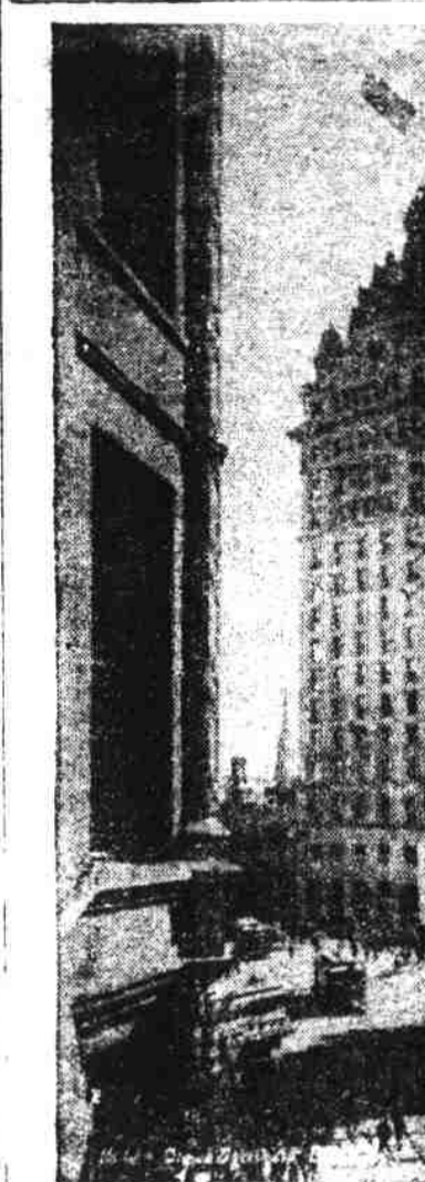
THE CALL BUILDING, ALSO DESTROYED.

Other imposing edifices, many of which have been more or less severely injured, are the Hotel St. Francis, the Police Hotel, the Hall of Justice, the Mutual Bank building, the Pacific Mutual life building and the Callaghan building. The greatest property damage resulted in the manufacturing district and the greatest loss of life in the tenement house district. The chief street of the city is Market, running diagonally for many miles. The destruction of many of the department stores and other business blocks on Market and Mission streets was almost complete. Fire aided to the horrors of the situation, and, as the water mains had been burst by the shock, the fire department was helpless. The flames ate their way along Market street and other fires started in different parts of the city. As the earthquake occurred but a little after 5 o'clock in the morning, practically the entire population was in