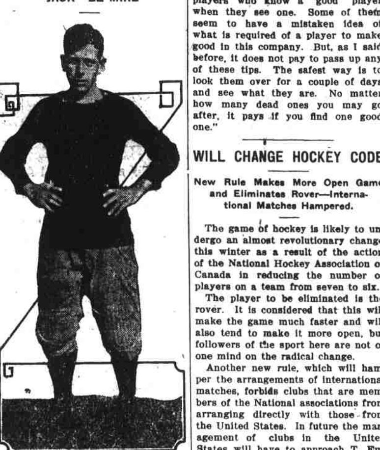
Fast Half-Back on University of Missouri Football Team.