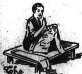
Tailor says -