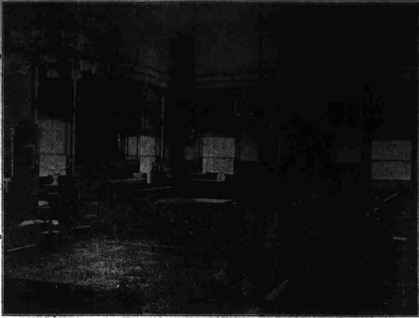
LODGE ROOM IN THE ELK'S TEMPLE.