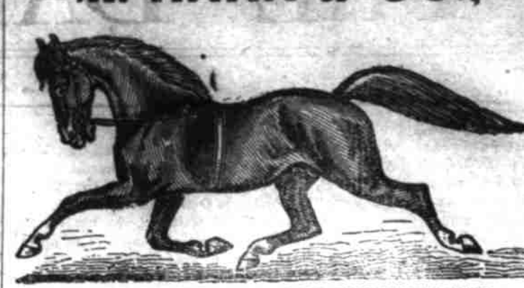
HAS JUST RETURNED FROM THE WEST WITH

50-READ BORSES AND MUL. RANGING FROM 4 TO 7 YEARS OLD, And Weighing From 850 to 1450 lbs. Each