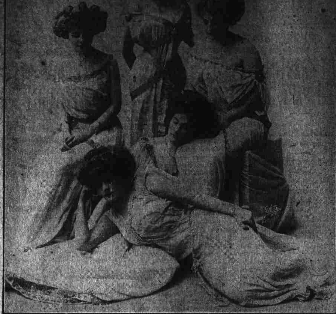
A Quintette Of Feminine Beauties Who Will Be Seen With "Mutt and Jeff" at the Masonic Theatre Tonight.