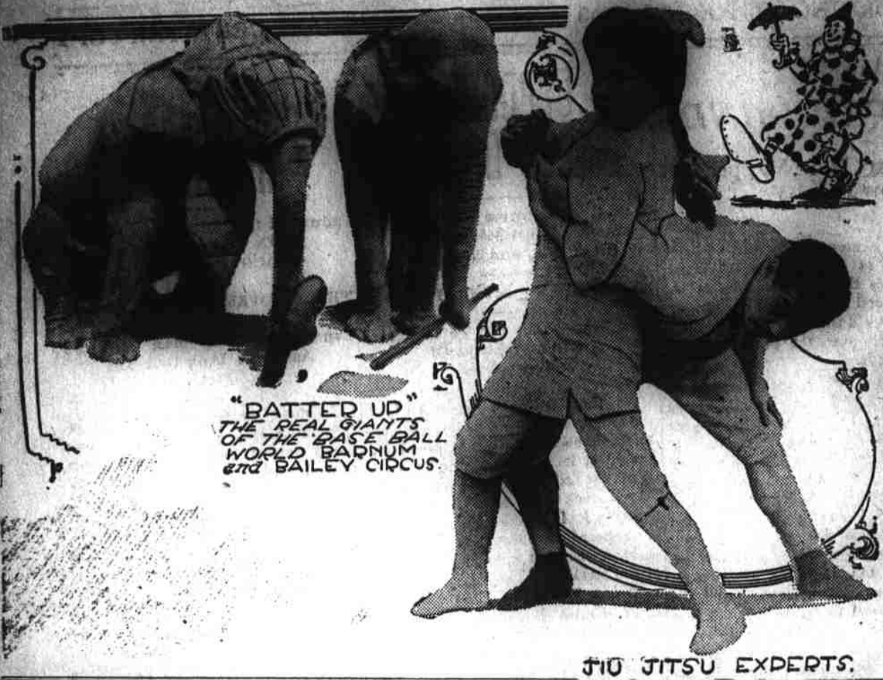
"BATTERED UP" THE REAL GIANTS OF THE BASE BALL WORLD BARNUM & BAILEY CIRCUS.

Exhibition of Jiu Jitsu To Be Seen Tomorrow With Largest Circus in the World