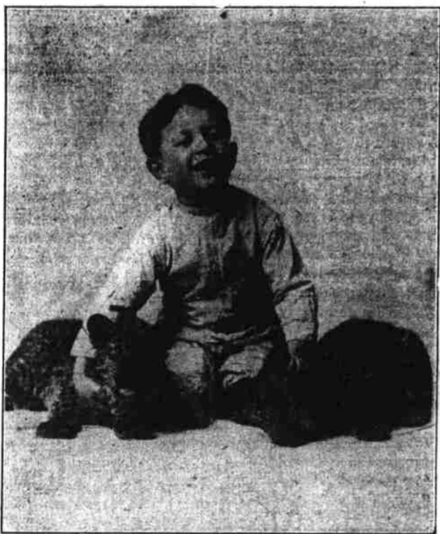
Two pets of the Animal Trainer's Son, to be seen next week with Smith's Greater Shows which will exhibit at the Ghent Show Grounds under auspices of Atlantic Fire Company

No odds how sick, headachy, bilious and constipated you feel, a Cascaret tonight will straighten you out by morning. They work while you sleep. A 10-cent box from your druggist will keep your head clear, stomach sweet and your liver and bowels regular for months. Don't forget the children—their little insides need a gentle cleansing, too.