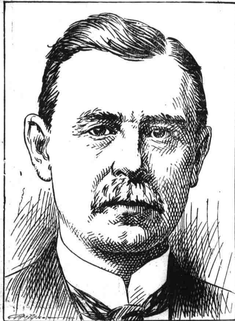
FURNIFOLD McL. SIMMONS, United States Senator from North Carolina.