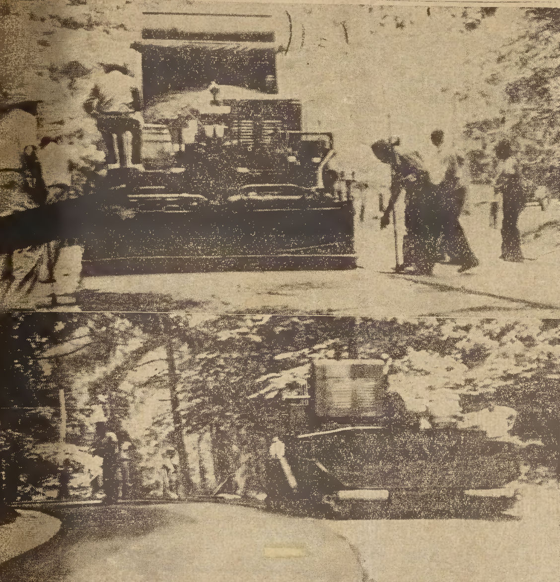
PAVING UNDERWAY —Residents of Westwood and Forest Hills, accustomed to mud-ruffed roads for many years, watched with delight this week as workmen and machinery of the William Reed Construction Company of Durham laid down a plant-mix black-top surface on their streets. The paving machine, shown in action above on Dogwood Drive, moved along at the rate of several minutes as trucks dumped their six-ton loads of black-top mixture into the hopper. Each load produced a 10-foot wide paving strip, approximately 85 feet long. The nominee for the most unpleasant job of the season is the man who drives the machine, shown above sitting on his perch directly over the hot plant mix. It has to be laid at a temperature of about 300 degrees. Add this to the 90-100 degree weather we've been having and you'd swap jobs with him. The paving program will probably next week into the Stroud Hill area and later to the Roberson-Graham Street area. Patching work will be done after the regular paving is completed.

VOLUME 1 NUMBER 19 $4.50 The Year By Mail CHAPEL HILL, NORTH CAROLINA, THURSDAY, JULY 22, 1954 Five Cents The Copy EIGHT PAGES THIS ISSUE