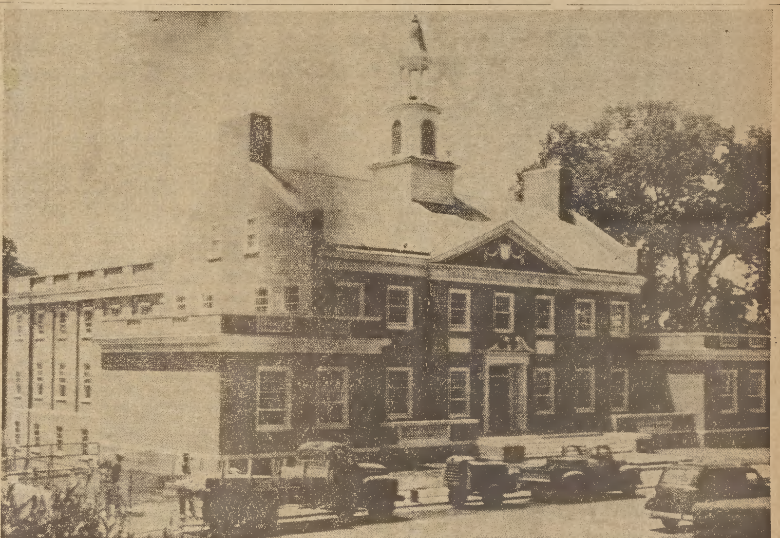
COURTHOUSE NEARLY READY —Orange County's new quarter-million dollar courthouse in Hillsboro stands complete now, except for the finishing touches of painting here and there. Moving day for many of the county offices now in the old courthouse will be