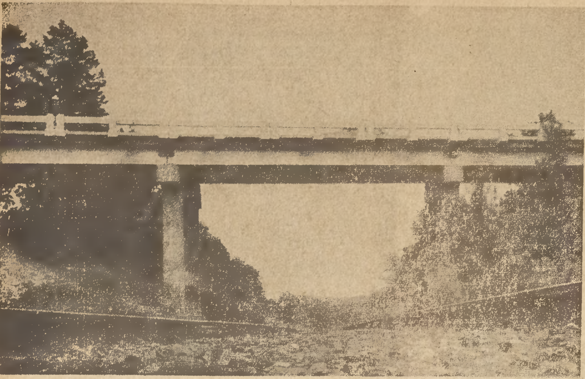
NEW HIGHWAY OPEN—It's two miles shorter to Hillsboro now over the newly-opened stretch of highway that runs through the woods from New Hope Church to the Farmer's Co-Op Livestock Market on old N. C. 10. Shown above is the bridge on the new road that crosses the Southern Railroad tracks near the northern end of the road.