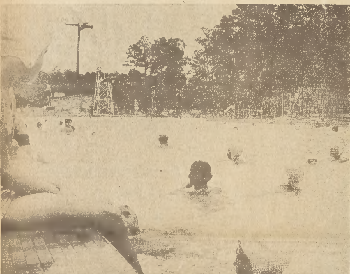
SWIMMING POOL CLOSES —The center of youth activity in the community for the summer—the University's Kessing Pool—closed down last Wednesday afternoon until next year. Several hundred youngsters—and adults too—participated in the daily recreational and instructional swimming program at the pool. Scene above shows a good crowd on closing day.