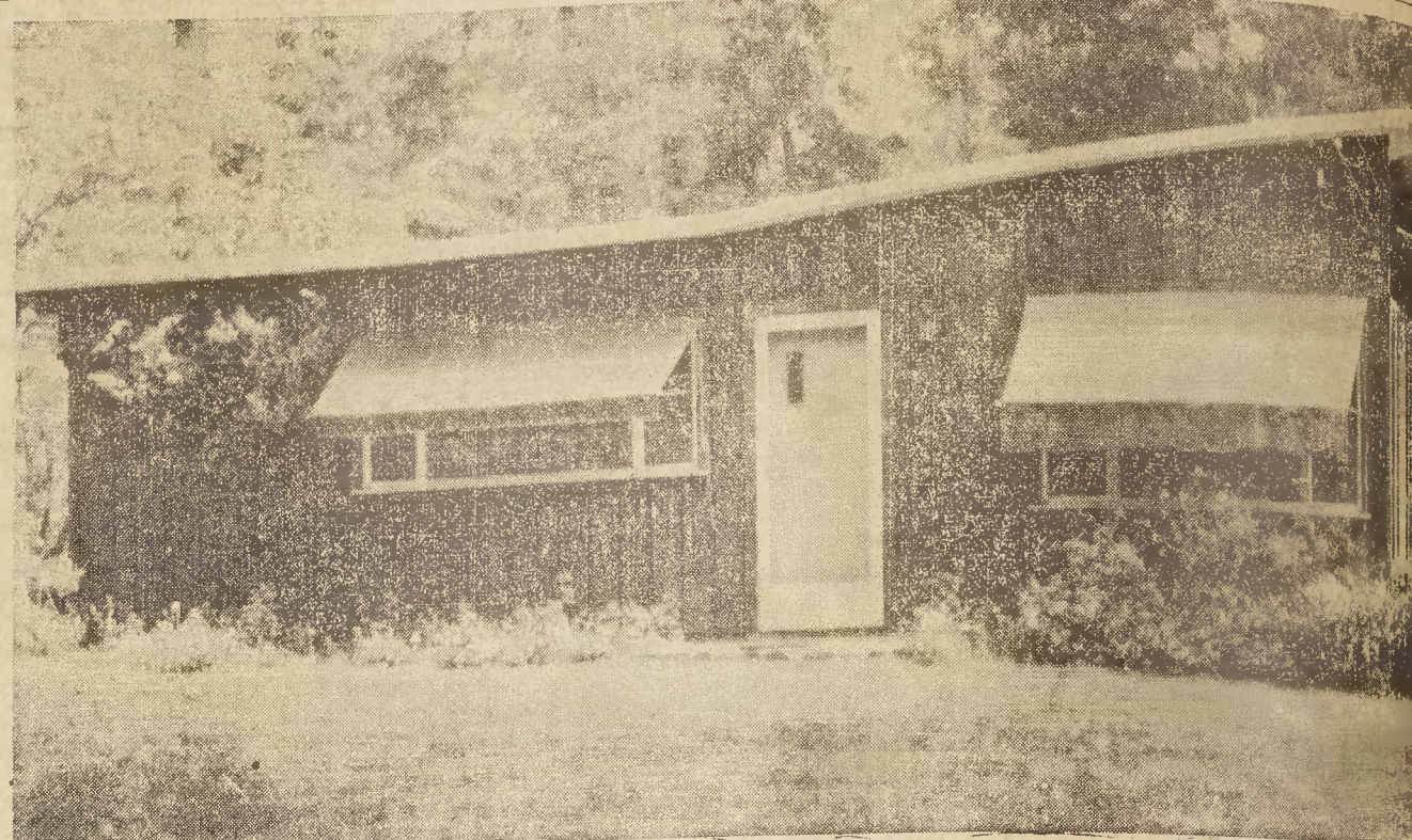
KAYLOR RESIDENCE —The Cornelius Kaylor residence, located on the Old Cedar Grove Road near the WUNC-TV tower five miles west of town, is shown above from the front (left) and side. Finished in red-creosote-stained vertical pine siding, the house is divided (front view) by the big Chapel Hill flagstone fireplace wall. At the left is the living room, to the right, also with private entrance on the flagstone terrace—the master bedroom. At the right the house is shown from the side, illustrating to good advantage the construction of the built-up roof and contact ceiling. The kitchen-dinette at the rear.