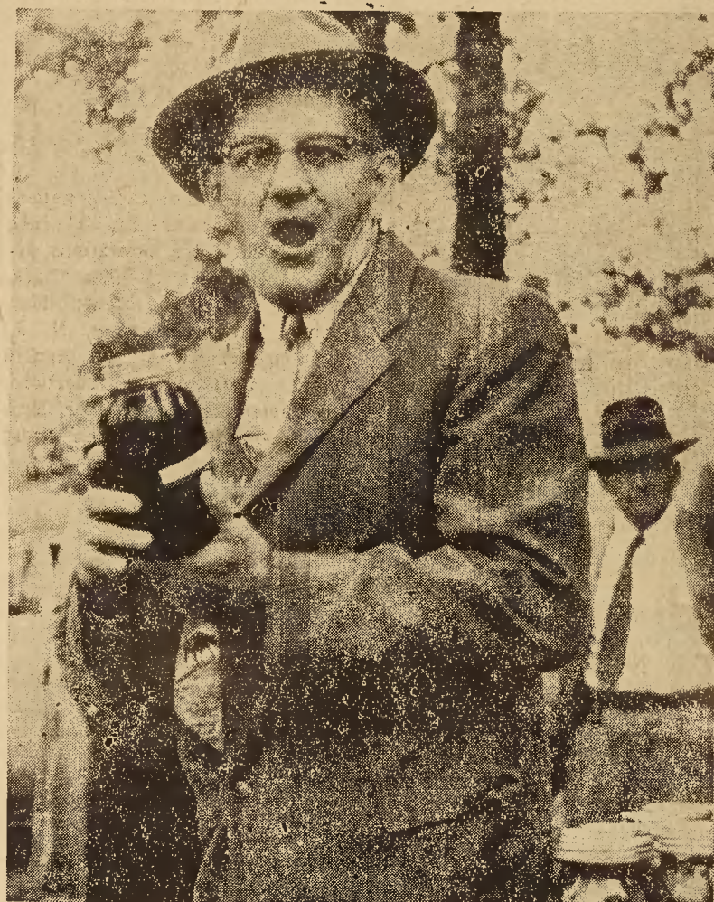
in getting a higher bid on a plate of home-grown tomatoes (left) and selling a jar of preserves (right).