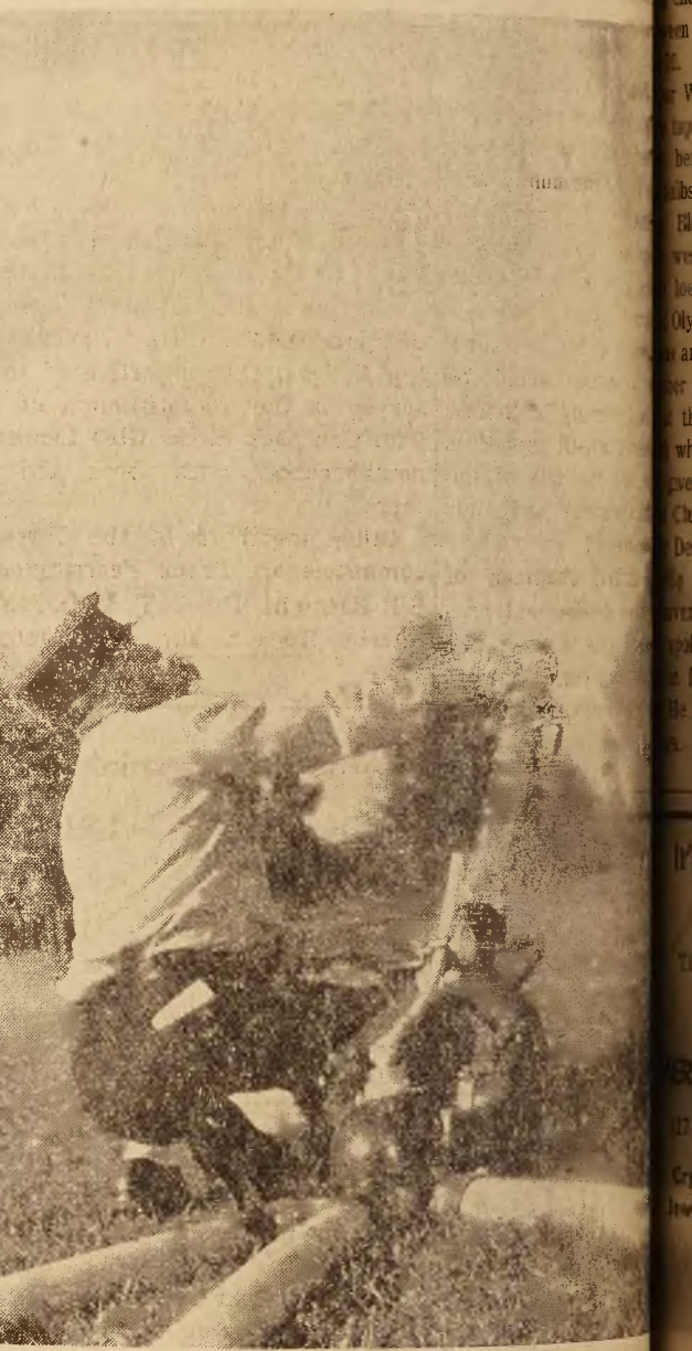
NEW NOZZLE —Fire Chief J. S. Boone checks the nozzle on the Chapel Hill Fire Department's special long-range nozzle during a test of the new equipment at the filter plant this past weekend. The new attachment takes the pressurized flow of three hydrant hoses and squirts it out in a single stream at a rate of over 1,000 gallons a minute.