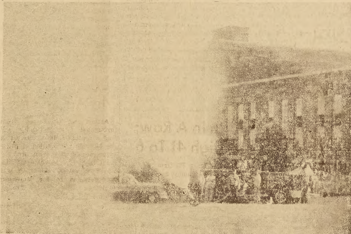
WIDE SPRAY —The spread of the fire department's new adjustable stationary nozzle almost obscures the truck and the Filter Plant during a test of the equipment at the Filter Plant this past weekend. Combining the flow of three hydrant hoses the new nozzle, purchased through the town's recent bond issue, will throw a stream of water over 75 feet.