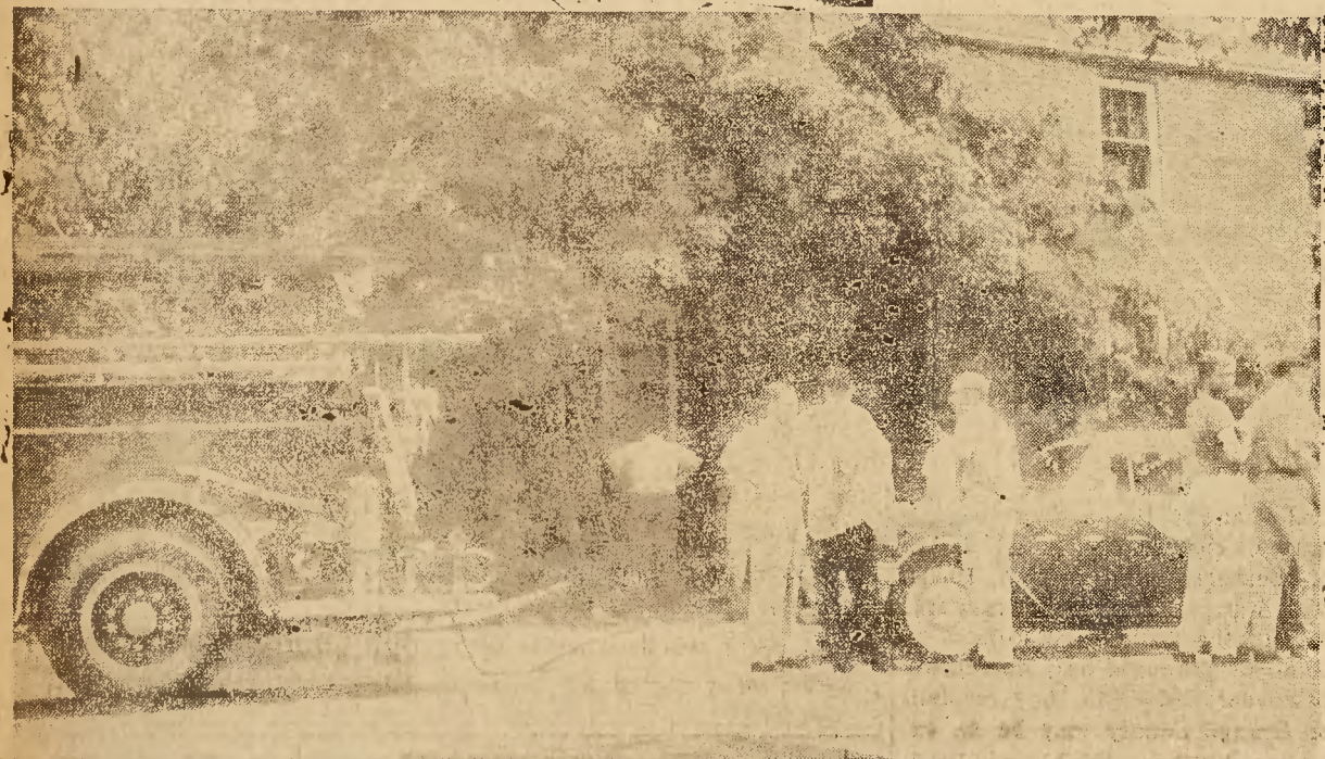
IT'S FIRE PREVENTION WEEK —A candid scene from one of Chapel Hill's most recent serious fires—the afternoon blaze that gutted the second-story apartment of Edgar Thomas at Pittsboro and McCauley Streets—serves as a reminder that Fire Prevention Week is a good time to check around the house for possible fire hazards.