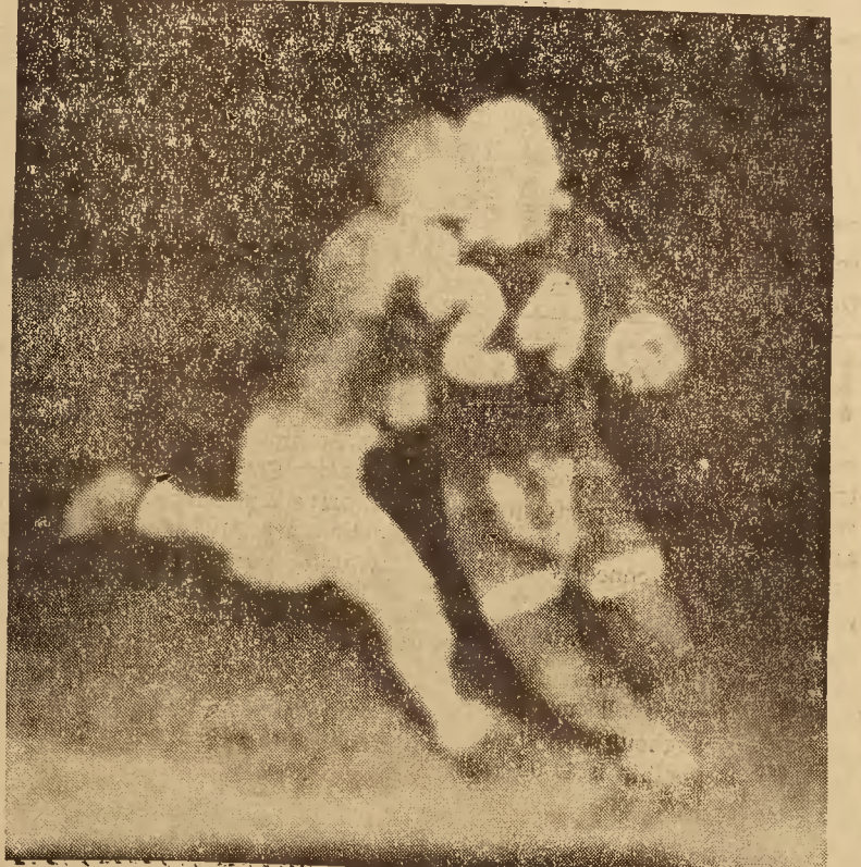
GOOD GAIN BY TURNER —Chapel Hill's Jimmy Turner gets off for one of the longest runs of Friday night's Chapel Hill-Hillsboro Battle, which ended in a 7-7 tie.