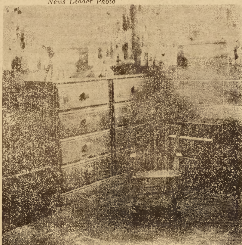
CHILD'S BEDROOM —The bedroom of three-year-old Lisa is located next to the driveway. High placement of windows provides privacy and allows flexibility of furniture arrangements. Exposed block walls are painted blue. Vinyl tile floors are red. Double closet with sliding doors has storage space for clothes and toys.

Contrast and horizontal line were added to the exterior walls by using brick veneer from ground to window level on three sides of the house. The wide eaves of the hip roof further serve to tie the house, located on a hill, to its site.