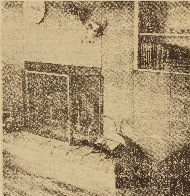
UNUSUAL FIREPLACE WALL —The living room is highlighted by the "stacked" fireplace wall. Contrast is produced by stacking each course of blocks directly in line with the blocks in the preceding course instead of staggering the blocks in the usual manner. The hearth is gracefully rounded at the corners. Plywood bookcase is built into niche in wall.

The living room has the only hardwood floor in the house which is built on a concrete slab. The other floors are of vinyl tile—a type of flooring that Mrs. Sparrow finds durable and easy to maintain.