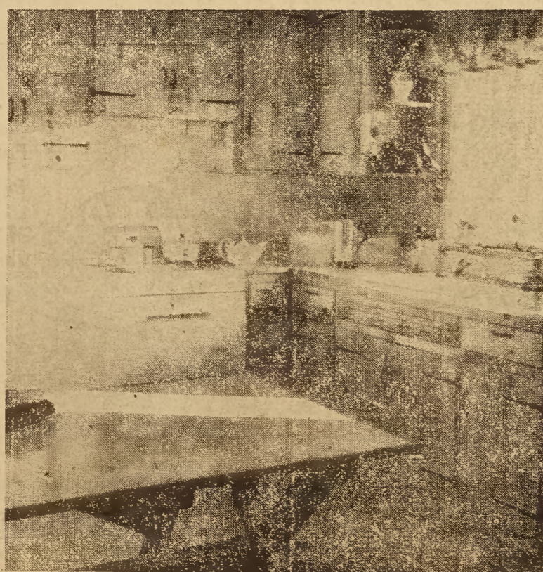
COMPACT KITCHEN —Mrs. Sparrow's kitchen in the corner of the kitchen-den is small and conveniently arranged. Tile board is used behind work areas. A fluorescent tube provides good lighting for the work area around the sink. Big window permits Mrs. Sparrow to watch child's play area at back.

The living room is well lighted by two large windows of a type that is becoming increasingly popular. The central section is fixed plate glass with sections on either side that are removable from the inside for cleaning. The "stacked" fireplace wall provides a center of interest with its unusual hearth and built-in bookcase.