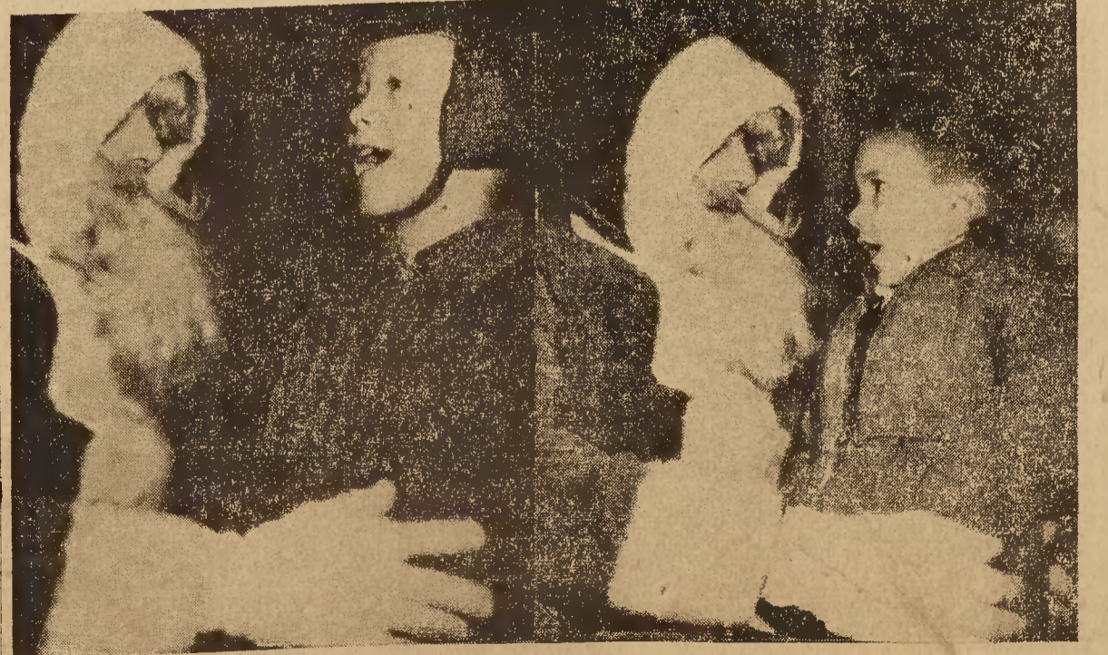
SANTA GREETS CHAPEL HILL KIDS AT CHRISTMAS OPENING CELEBRATION... "And A Cre-e-e-at Big Fire Engine, Too"... "A Big Six-Shooter Gun And Some Spurs"... "I'm A Real Good Boy, Santa"... "And My Brother Wants A Bike"...