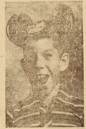
MOUSEKETEER —The young fry will love the Mouseketeer hat, official Walt Disney cap made by the George S. Bailey Hat Company of California. It's the sort of gift they'll want to be in style with the popular TV show.

A Gift for Everyone Christmas Seals fight tuberculosis 1955 CHRISTMAS GREETINGS 1955