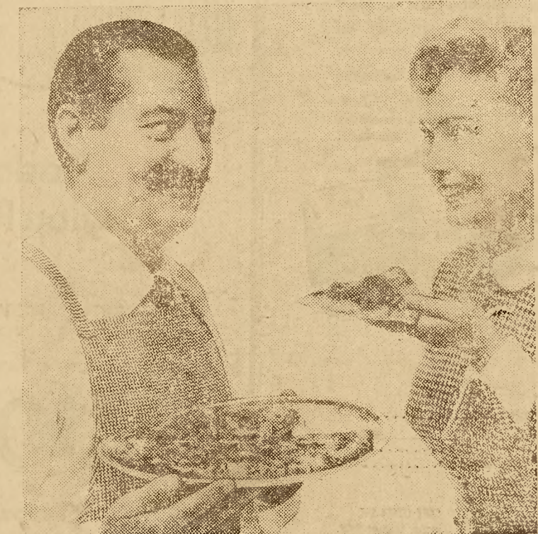
TASTE THRILL —The newest taste thrill in America today is tangy, tasteful pizza. Jerry Colonna suggests it as a Christmas party treat for a family meal, hors d'oeuvres for cocktail parties, or a tempting snack for holiday get-togethers. In the new pizza package mixes everything needed is handy. Just mix, fix, and bake!