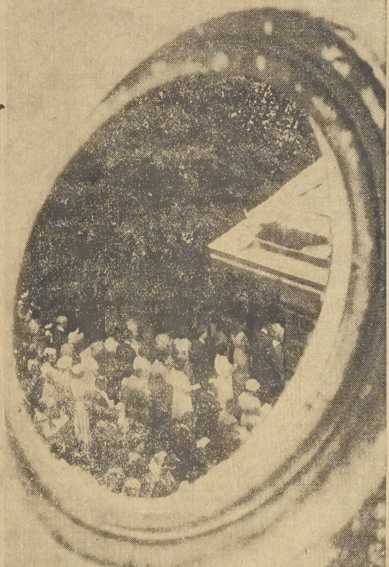
PRESBYTERIANS PICTURED—Framed through an empty balcony window in the burned skeleton of the Chapel Hill Presbyterian Church are worshippers at the formal groundbreaking ceremonies Sunday for the Church's new student center and educational wing. It will be built on the site on which they are standing.