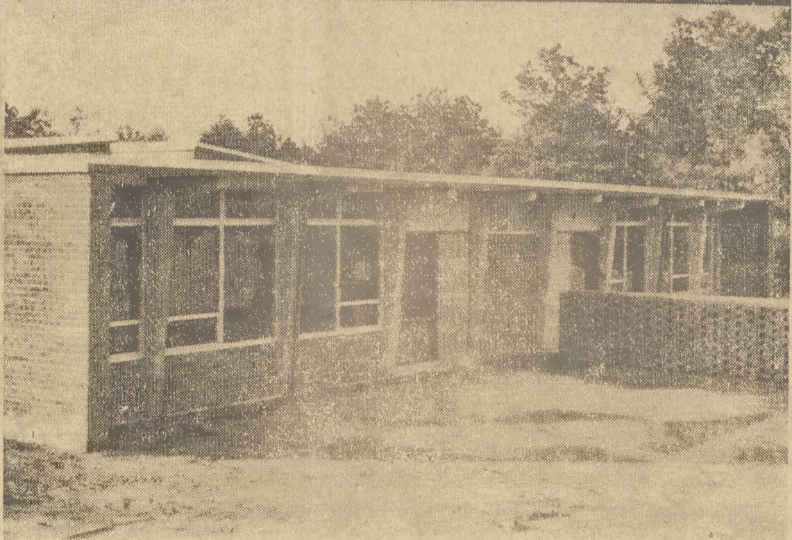
ACCEPT CARRBORO SCHOOL—The newly-completed 16-classroom Carrboro Elementary School has been accepted from the contractors by the County Board of Education, subject to a few minor construction details. Above may be seen the administration and elementary classroom wings of the building, while below is a section of the primary classroom building, showing the outside entrances and play areas by each room.