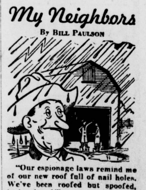
Our espionage laws remind me of our new roof full of nail holes. We've been roofed but spooofed, had and mad!

The students showed much interest in the Times' facilities and equipment, and what is required in the publishing of a newspaper. They found the mechanical department particularly fascinating, and members of the staff showed and demonstrated to them the operations of linotype, Ludlow, clod, press, metal-casting, etc. machinery. Some carried away as a souvenir, his or her name cast on a lead slug by the linotype operators.