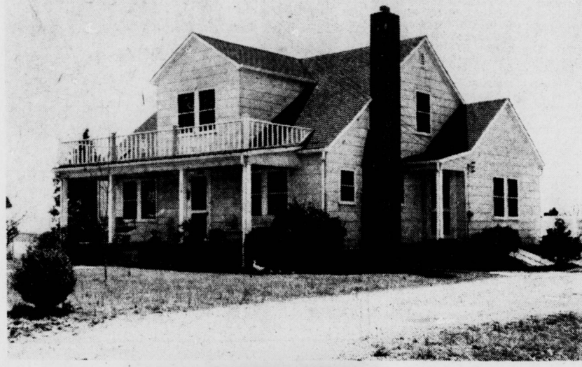
Pictured above is the attractive 8-room pastorium of the Lincoln Avenue Baptist Church. On the left is the Lincoln Avenue Baptist Church building, seating capacity of about 650. A special service is planned at the church Sunday morning.