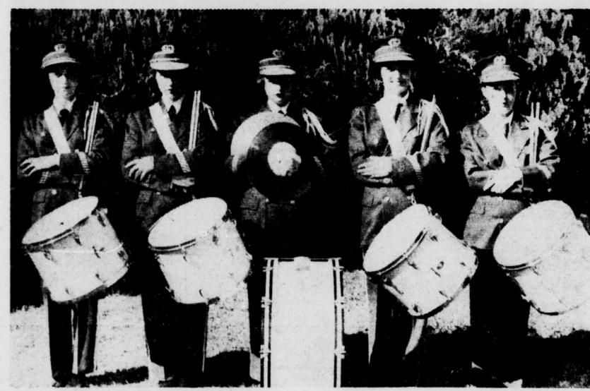
CHERRYVILLE BAND . . . Pictured is the drum section from the Cherryville high school band which will be featured in pre-game and halftime activities at the Lincolnton-Cherryville