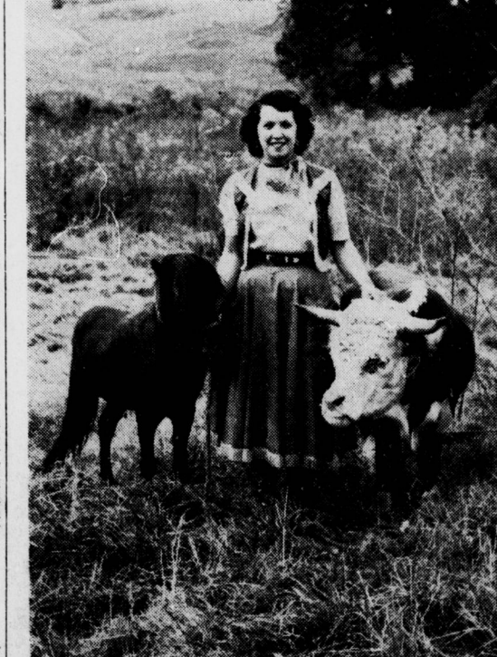
ON DISPLAY HERE ... Keno and Duffy, pictured above with the pretty lady, are now on exhibit in front of the county courthouse, sponsored by the VFW Post. Keno is reputed to be the "world's smallest bull, Duffy the "world's smallest horse." Keno is from the Chris Church, Colo., and Duffy from the canyon country of Arizona.