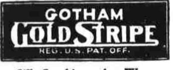
Silk Stockings that Wear

are precisely the same as those sold in the manufacturer's Fifth Avenue Shops. They bring to our patrons the very newest of colors almost the day they appear on the Avenue.