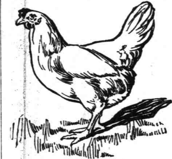
White Leghorn Hen.

If eggs alone are wanted, it will be best to keep only non-sitting breeds, of which Leghorns, Minorcas, Andalusians, Houdans, or Hamburgs will do well on the farm. If necessary, the eggs may be hatched in incubators, which, in careful hands, now do good work; or a few may also be kept of some sitting breed. Pure bred fowls, useless for showing, can usually be obtained at a low price; and after all is said against "fancy" birds, as a rule they will pay better, selected with intelligence, than average farm mongrels. But any decently fine farm stock can be greatly improved by