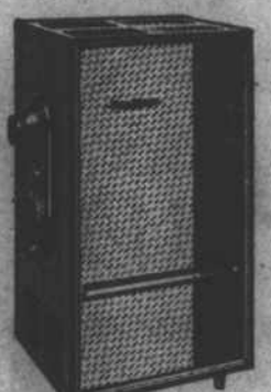
MODEL 977 Cocoa Tan and Satellite Brown

Read your BIBLE daily and GO TO CHURCH SUNDAY