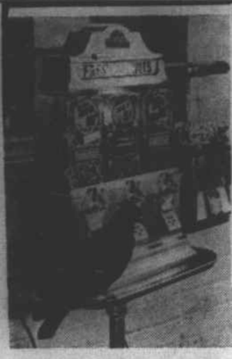
WAITING FOR LUNCH... This pigeon waits on a Washington, D. C., vending machine for lunch, patiently knowing that a passerby will soon use the machine and there'll be leftovers.

When a girl enrolls in the dress revue program, she already knows how to sew. Scoring is as follows: finished garment 25 points; construction, 25; suitability of attire and value for money spent, 50 points. Participation in the dress revue program is only "doing what comes naturally." There's scarcely a girl who passes up a chance to dress up and gain approval of her friends. Local volunteer 4-H Club leaders and Extension agents show the girls how to model; why accessories must be right; the importance of color and design in making a garment. Helpful hints also are given on posture and grooming. The national 4-H dress revue is a joint production of Simplicity Pattern Co., the Cooperative Extension Service and the National 4-H Service Committee. Simplicity also pays for the girls' trips, provides funds for the county medals and entertains the 51 winners at a colorful pre-Christmas party during the Congress.