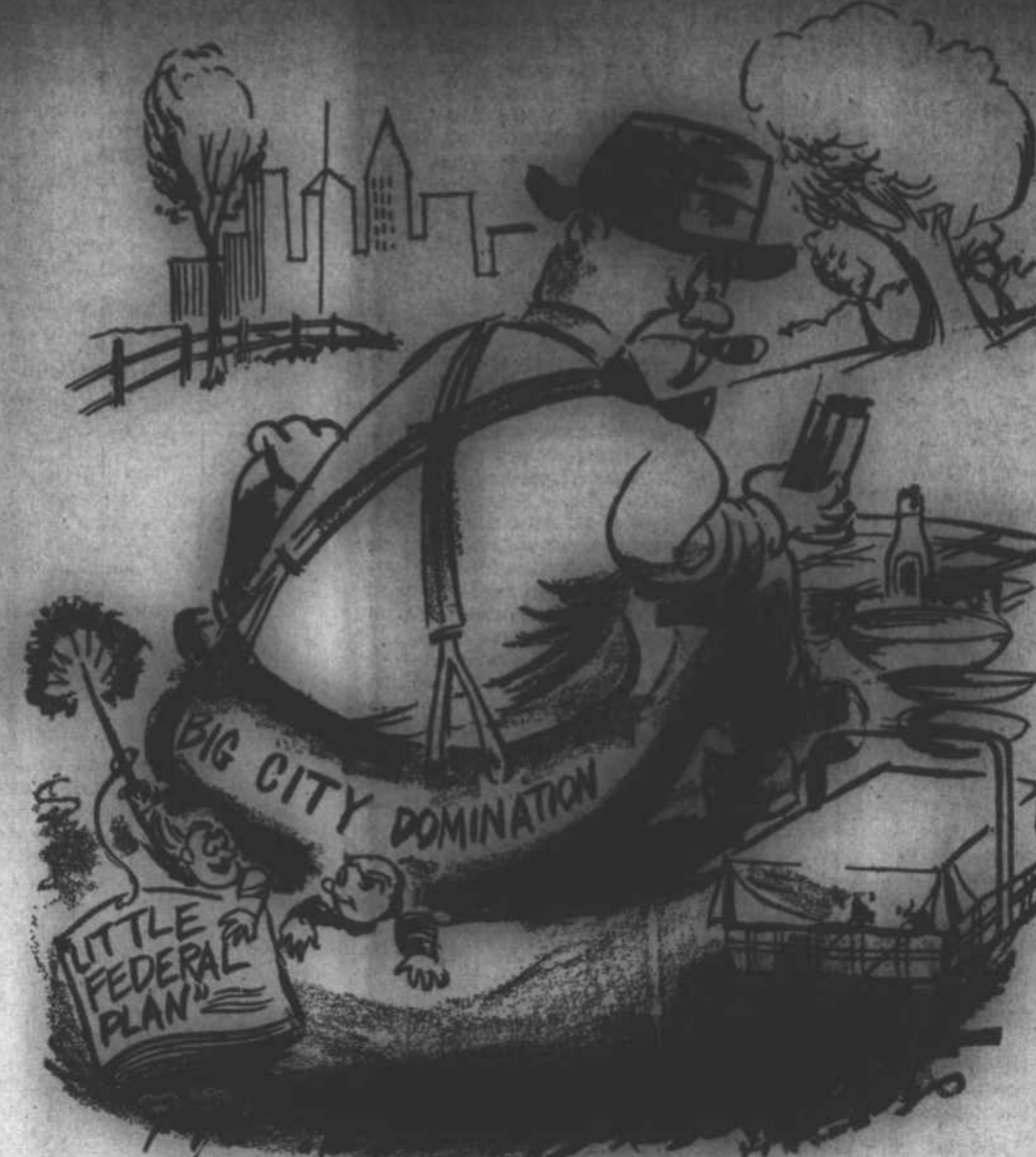
"HE WON'T HAVE ANY PICNIC ON US!"

The current law, such as it is, is virtually impossible to enforce. Police men must