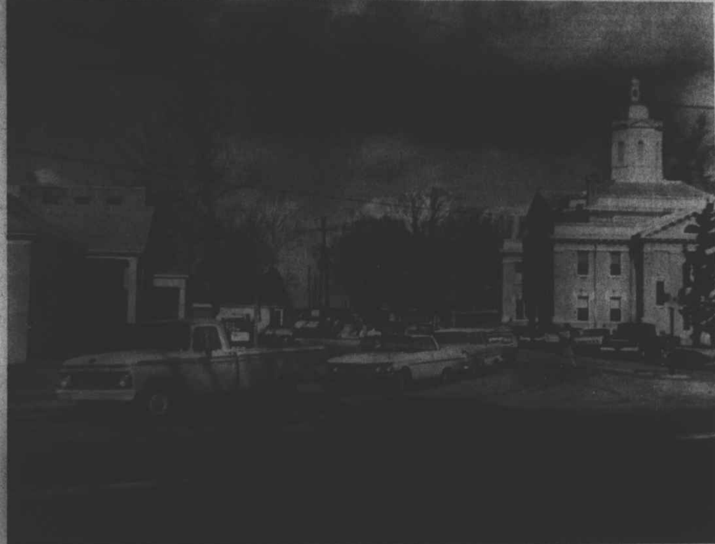
THE MISSING TREES—In front of the Agriculture building, Jail, Attorney Stevens office, beside the Court House and in back of the Court House have been removed to relieve parking congestion in Kenansville on court days. The trees in the background are on the Hospital grounds. More parking area but less shade for summer. The ancient old Oaks and Sycamore are gone!