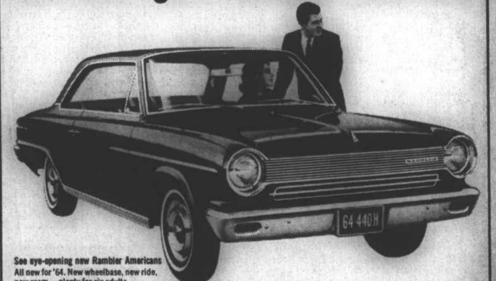
See eye-opening new Rambler American. All new for '64. New wheelbase, new ride, new room — plenty for six adults.