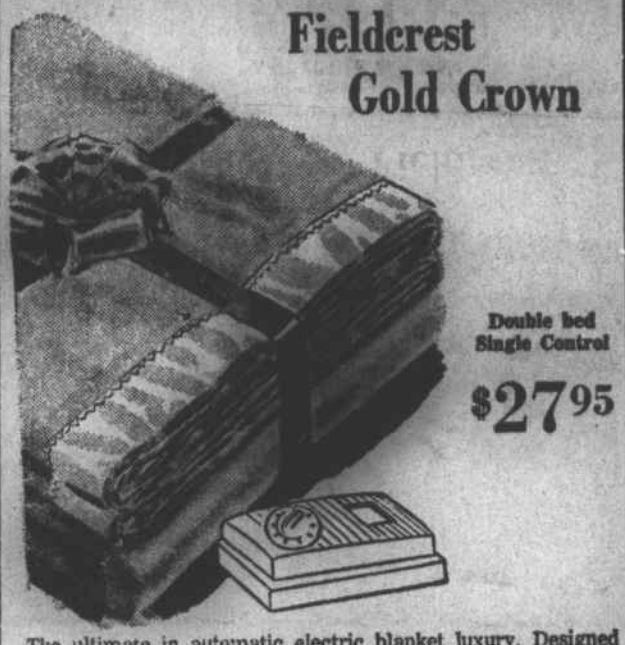
The ultimate in automatic electric blanket luxury. Designed to keep you warm under any condition. A full five year guarantee. Colors of blue, white, green and brown.

has the largest selection of Blankets in Eastern N.C. Come in soon to see those listed below plus many, many more.